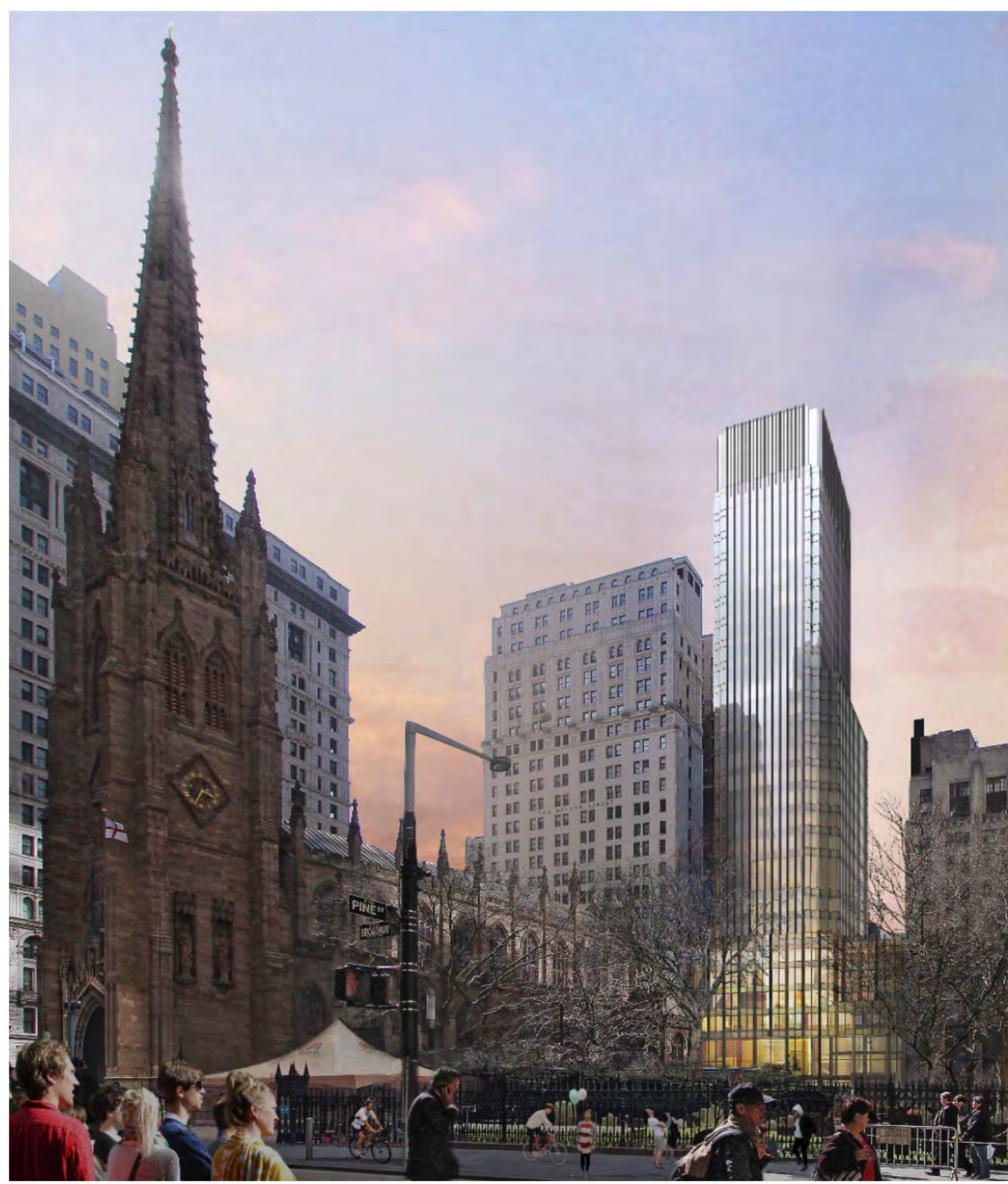
68-74 Trinity Place, view from east, image from Trinity Church

BY: ANDREW NELSON 8:00 AM ON MARCH 21, 2018